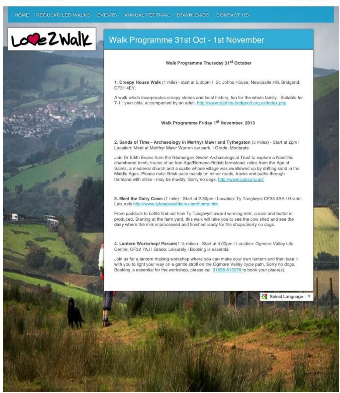
In partnership with Love 2 Walk