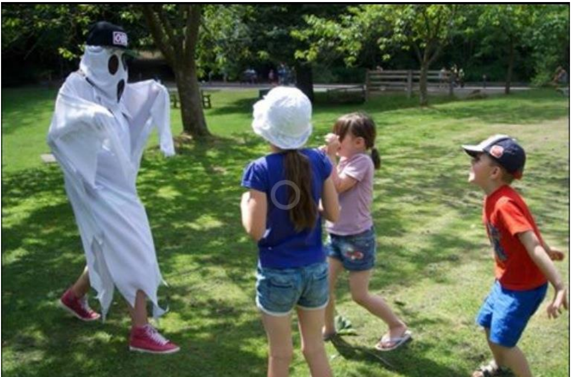
Ghost playing with children at Bryngarw picnic